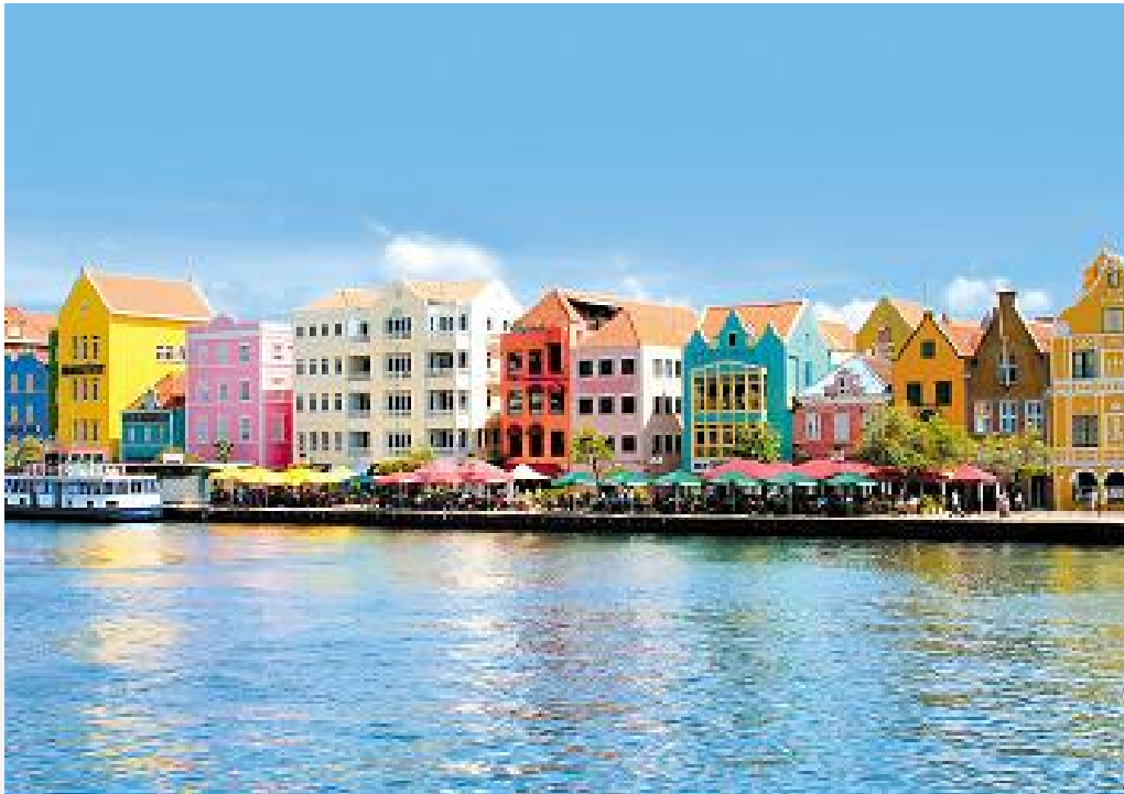
Downtown Willemstad on the Punda side, the capital of Curacao.